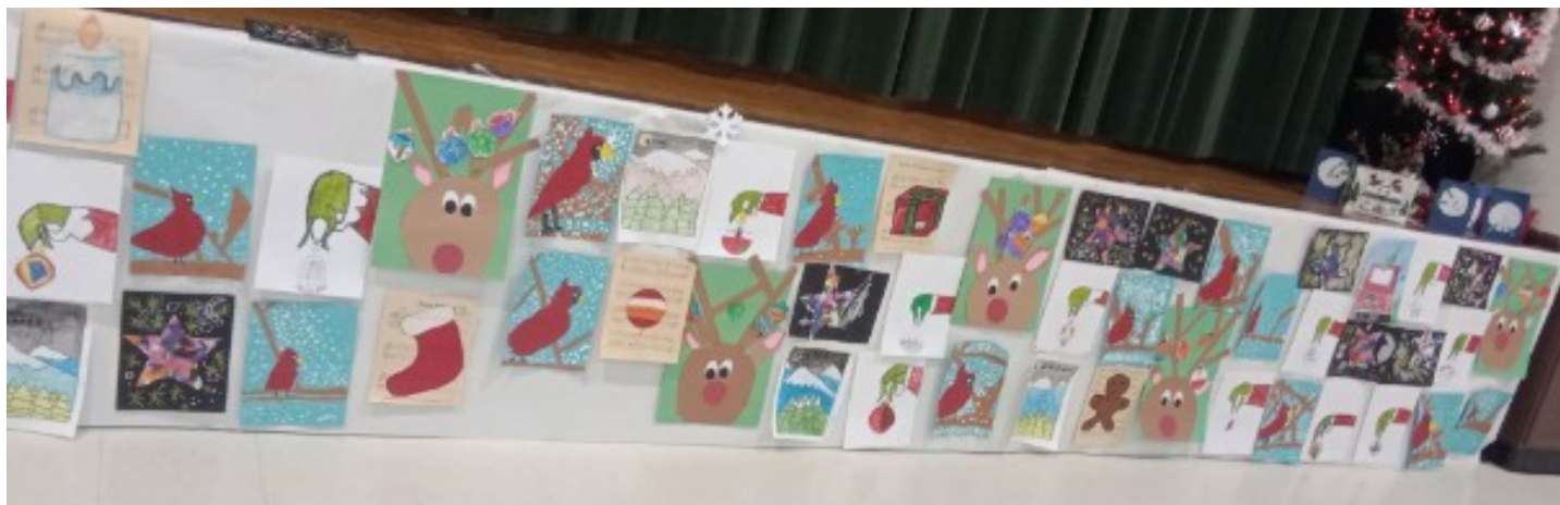
A closer look at some of the artwork displayed at the Christmas program.

FRI., JAN.27-----SECOND QUARTER HONORS ASSEMBLY: TIME 2:00 - 2:30 P.M.